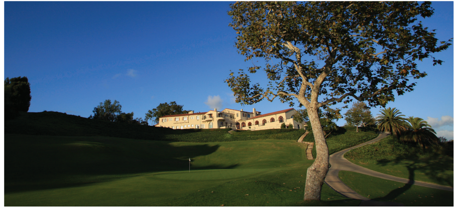
The Lil' Pro played in two L.A. Opens (currently called the Genesis Open) and once qualified there for a PGA Championship spot.